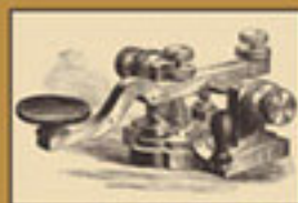
1874 - Telegraph service reaches Idaho City.

1890 - Idaho becomes the 43rd state; Idaho City's population is now less than 500.