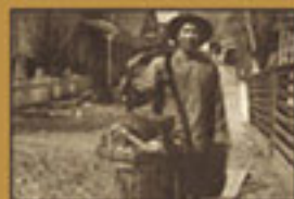
1865 - One-third of Idaho City's population was Chinese.