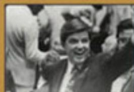
1976 - Senator Frank Church announces his candidacy for U.S. President on the courthouse steps.