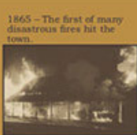
1865 - The first of many disastrous fires hit the town.